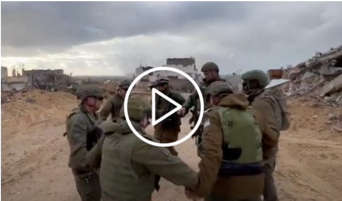
Singing Am Yisrael Chai with our soldiers in Gaza